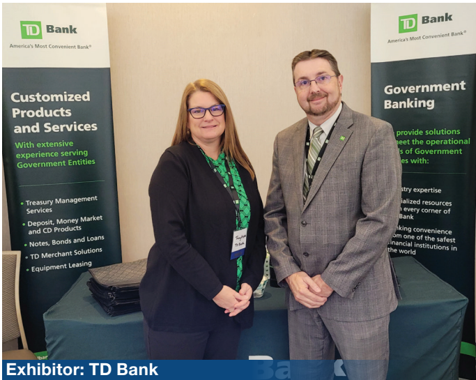
Exhibitor: TD Bank