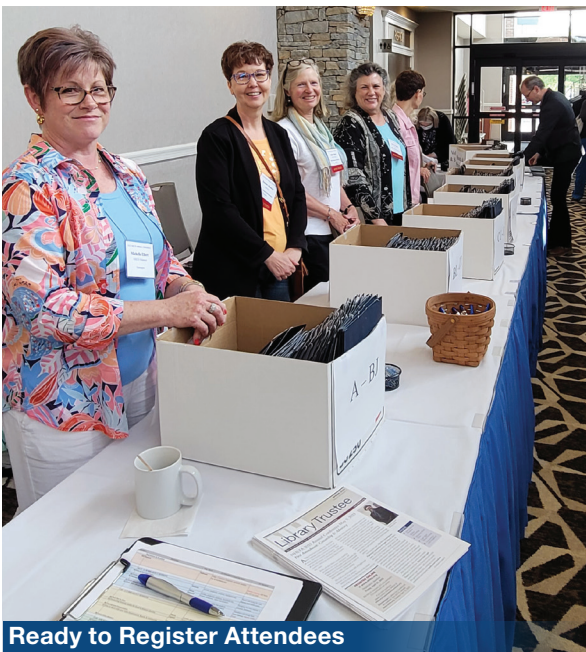
Ready to Register Attendees