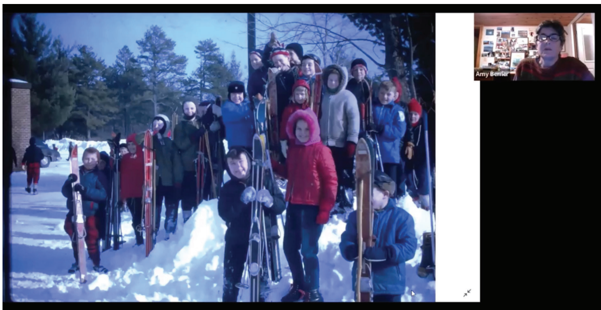
RIGHT: Face to Face: The Tamworth Outing Club.