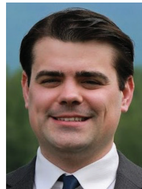
By Natch Greyes, Government Affairs Counsel, NH Municipal Association (NHMA)

Editor's Note: NHLTA will present a Trustee Orientation on July 17, from 10 am–2 pm at the NHMA Building in Concord. For those unable to attend, there is a three-part Orientation webinar complete with downloadable handouts available on the NHLTA website. A recommended list of policies and some sample policies are also available on the website.